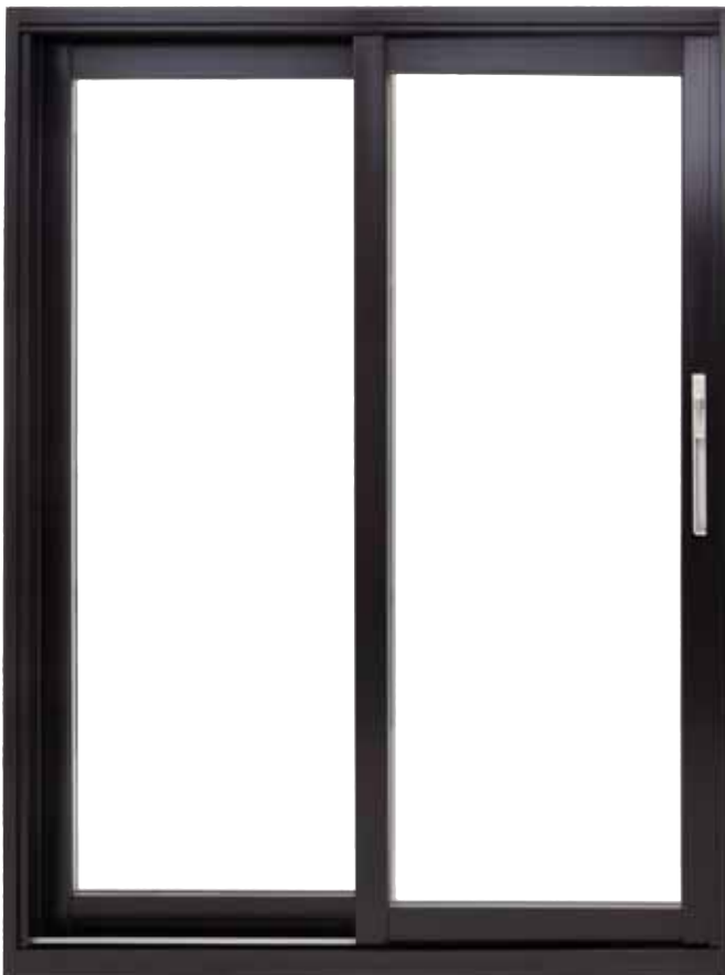
plus "Robusto" Screen